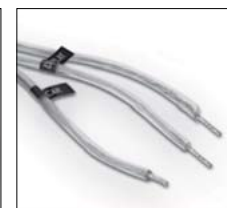
Assembly option : car and display