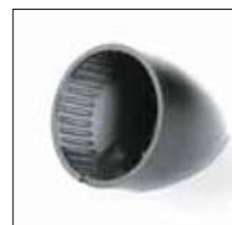
Tilted mounting Easy installation