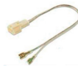
• Woofer connector extension