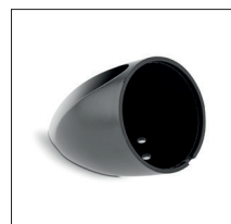
Tilted mounting frame: Easy to install